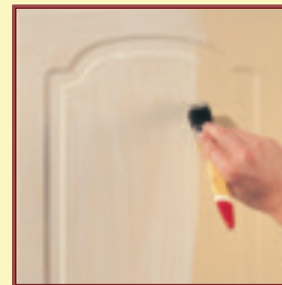
2. Liberally apply the graincoat