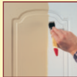
1. Apply 1-2 base coats & allow to dry

• Comprehensive instruction leaflet included in pack