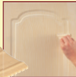
3. Comb through to create a lined effect