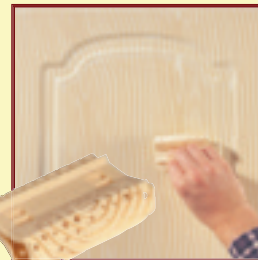
4. Use the graining tool to create the grain effect

HOW MUCH IS NEEDED? 1 Litre of Basecoat is normally sufficient to treat: